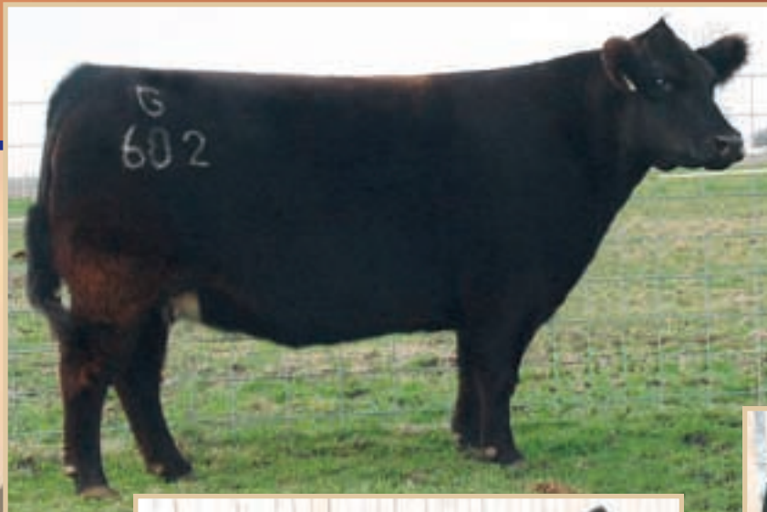
602G Chill Factor Dam of Lot 94; grandam of Lot 95