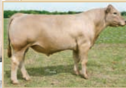
DSUL Outlaw (Foreplay x Calamity Jane 829) Service sire on several of the bred heifers. Maternal brother to Lots 77 through 79.