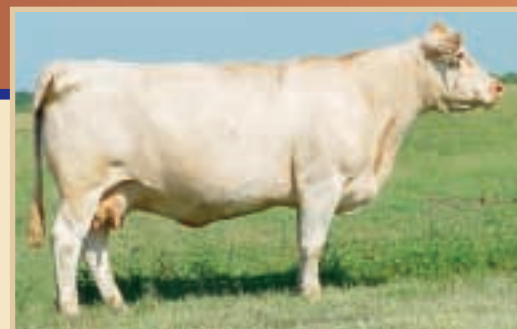
Calamity Jane 829 Dam of Lots 77 through 79