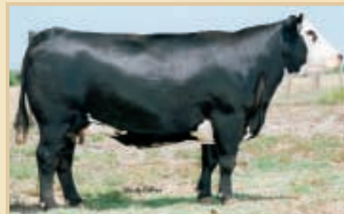
DSUL Tank 16B Dam of Lot 116