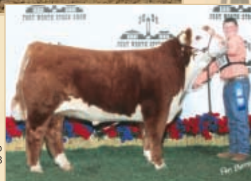
Flush brother to Lots 167 and 168