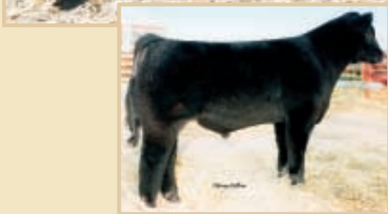
Mossy Oak Eight daughters sell