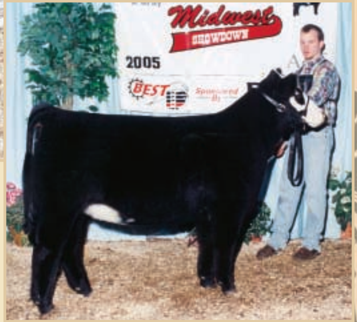
Lot 53 Daughter