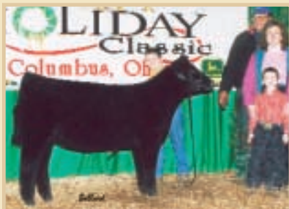
This heifer shown by Austin Trueblood was the 2003 Ohio High Point Heifer. Her dam sells as Lot 18.