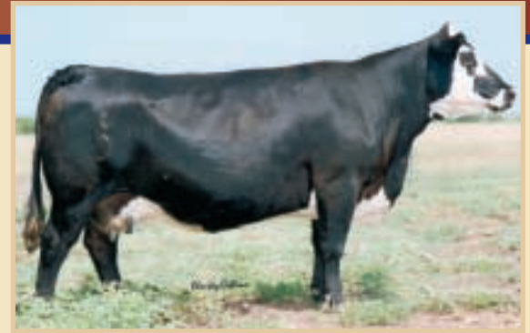
3C/DSUL Meyer 356 Dam of Lots 133 and 134; she sells as Lot 47