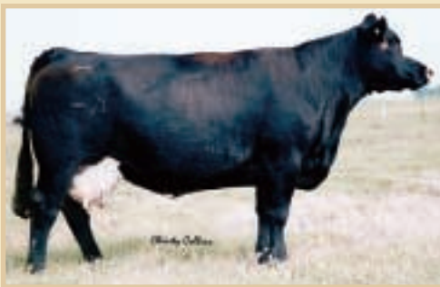
K-Bar Meyer 415 Dam of Lot 137