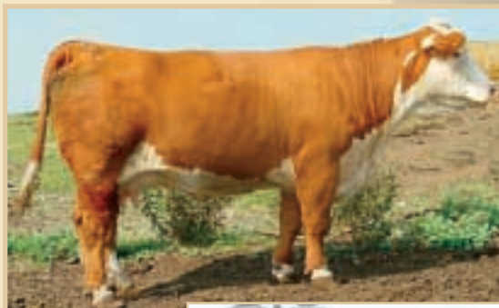
B&S Miss Summit 145E Dam of Lots 167 and 168