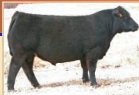
BAX Legit 45-172 (OCC Legend 661L x BAX Marisa Adina 172-455) His service sells