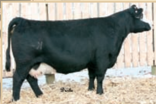
DSUL/K-Bar Meyer 418 Dam of Lots 131 and 132; she sells as Lot 46