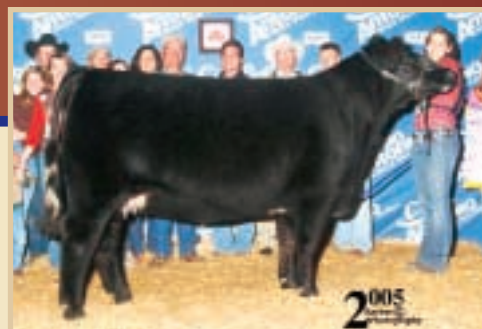
Reserve Supreme Champion Female, 2005 San Antonio Stock Show. Full sister to Lot 94.